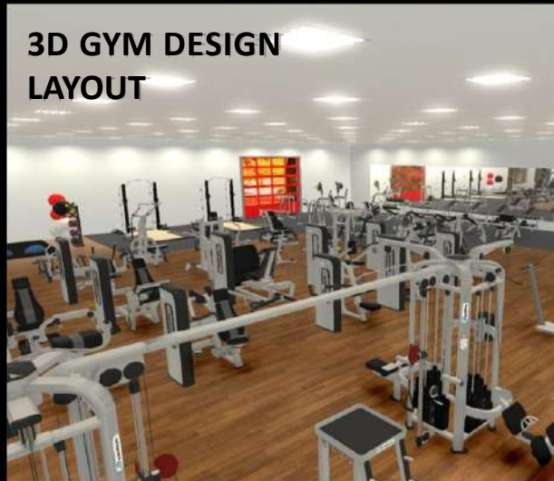
3D GYM DESIGN LAYOUT