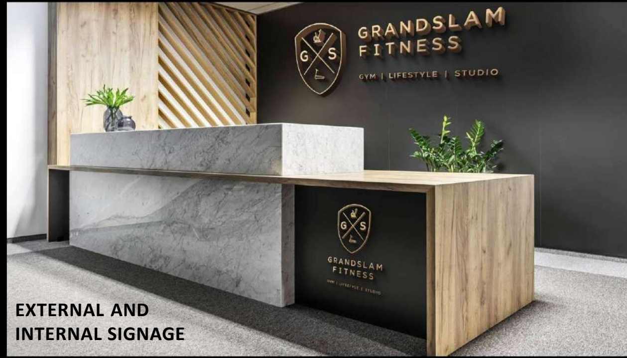
EXTERNAL AND INTERNAL SIGNAGE