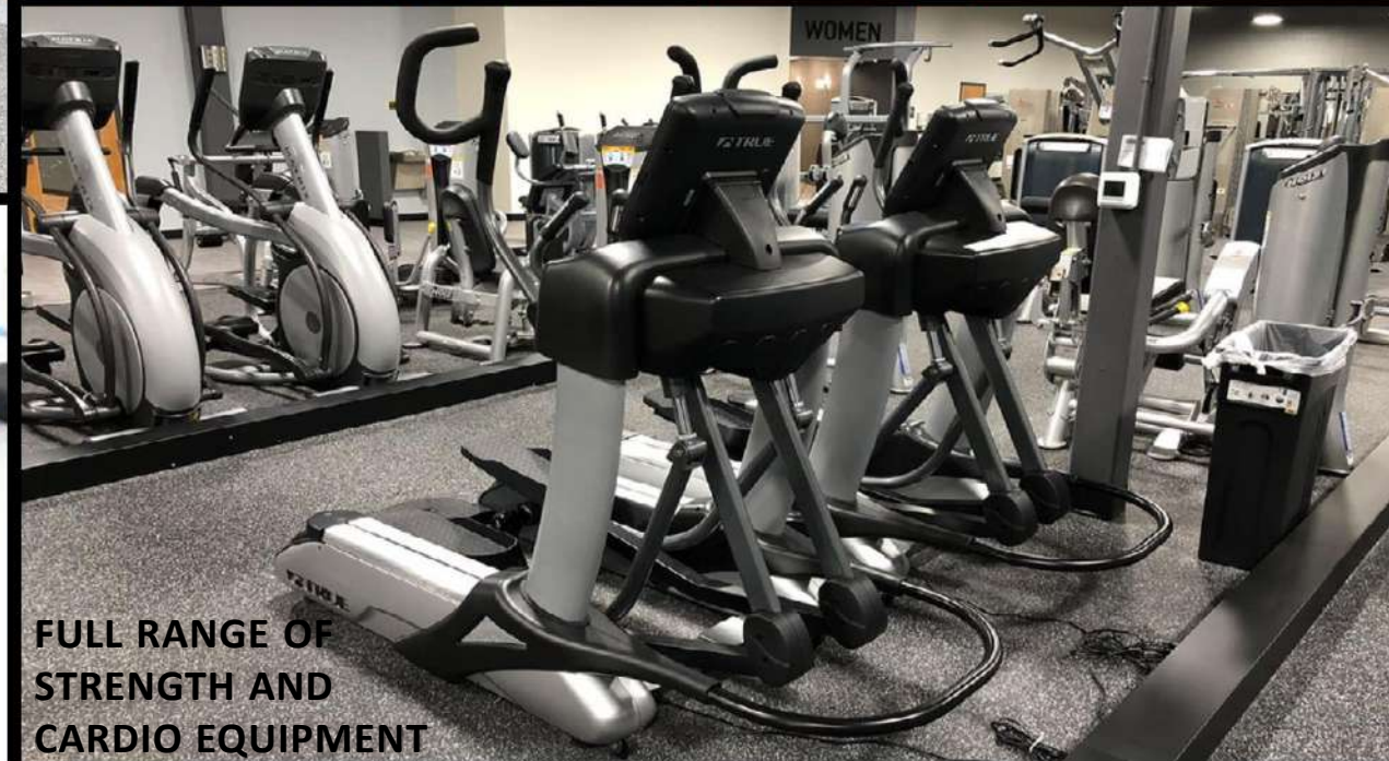
FULL RANGE OF STRENGTH AND CARDIO EQUIPMENT